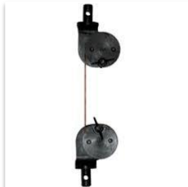
Wire rod fixtures * Optional