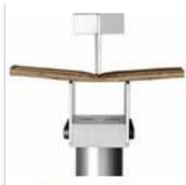
Bending Fixtures * Optional