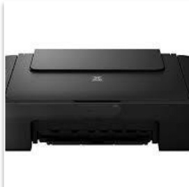
Color inkjet printer * B series