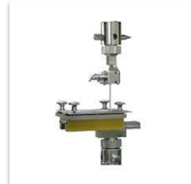
90° Peel fixtures * Optional