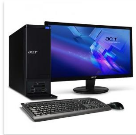
Branded commercial PC * B series