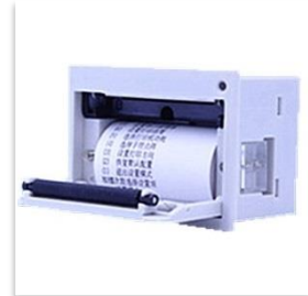
Build-in mini printer * A series